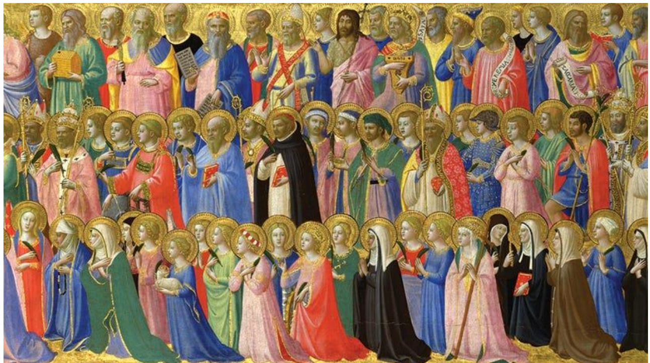
The Communion of Saints